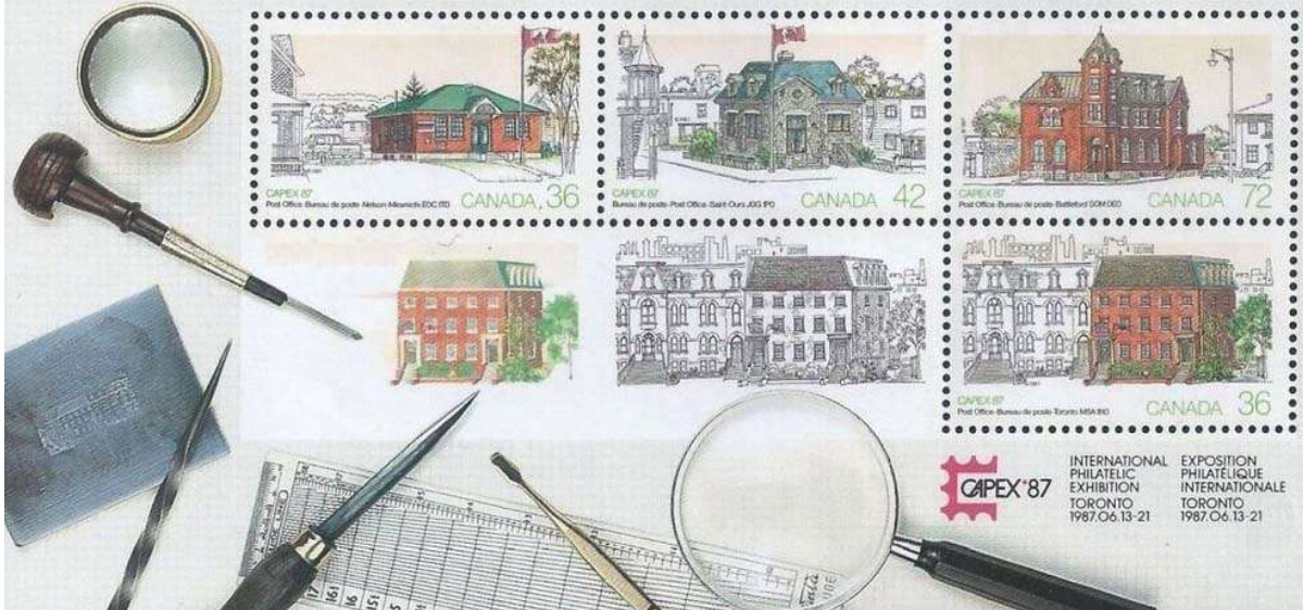
Hojas conmemorativas de la exposición

LE CENTENAIRE DE L'ORGANISATION DE LA PHILATÉLIE AU CANADA